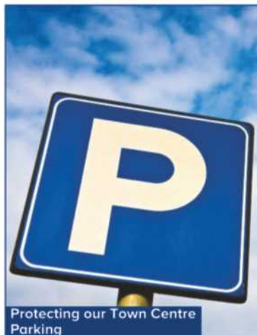
Protecting our Town Centre Parking

Contrary to many news reports, we have committed to seeing no loss of parking in the town centre and actually are looking to see parking improve. The Bournemouth Development Company, which is building houses with the Council, ALWAYS replaces parking on any new town centre developments; often with new multistorey parking on site. To date, there is now MORE PARKING in the centre - not less!