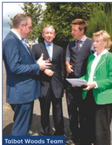
Talbot Woods Team

Working with a committed group of local residents, an almost unprecedented number of objections were gathered for the scheme, with the result being that the plans will no longer go ahead.