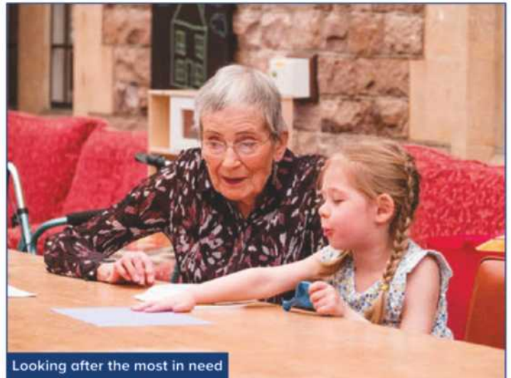
Looking after the most in need

Councils now do more than collect bins and fix potholes - and we have to make sure we do the best job possible.